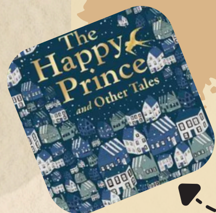
This Term's Books!

We will also be reading 'The Explorer' by Katherine Rundell, focusing on the author's language choices and vocabulary.