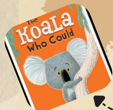
This Term's Books!