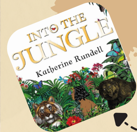
This Term's Books!

We will start the year by refining our knowledge of place value, working with numbers between 1 000 000 and 10 000 000. As part of this, we will learn how to compare and round numbers by using and applying our understanding of place value. We will then work on applying our understanding of the four operations both on their own as well as in more complex equations including those with brackets. We will also learn how to find common factors and multiples of numbers. We will then work on fractions, learning how to simplify fractions as well as adding and subtracting fractions with different denominators and multiplying and dividing fractions.