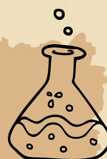
This Term's work is linked to the Scientist Andreas Vesalius

The children will be completing a unit on Animals Including Humans: this unit focuses on healthy teeth. Once we have learned about the types of teeth, we move on to the digestive system. Following that, we will be learning about food chains and using the correct scientific language to describe prey and predators.