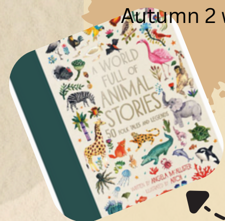
This Term's Book

In Reading, we will be reading different stories from 'A world full of animal stories'. The children will initially focus on retrieval questions from the stories but also draw inferences by looking at characters' feelings, thoughts and motives from their actions, the children will then justify their thoughts with evidence from the text. During Autumn 2 we will move on to the novel: 'The train to impossible places'